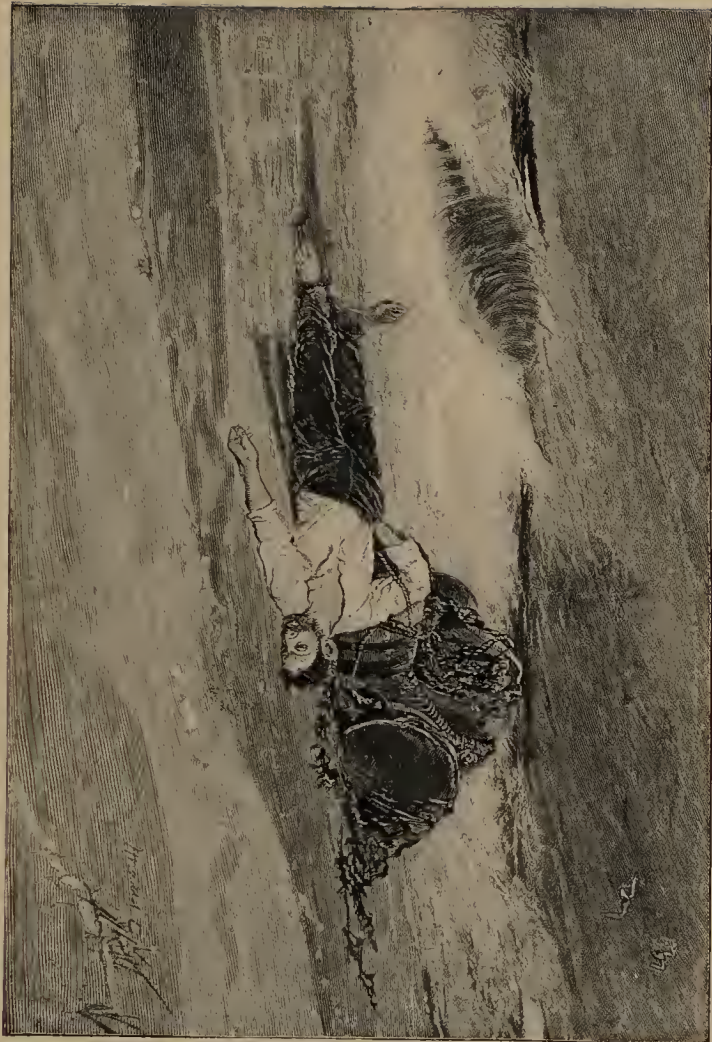
“BATTERED AND BRUISED, FOREVER ABUSED”